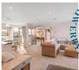
Coastal chic and a bird's eye view at Peewits Penthouse