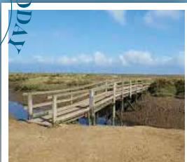
The bridge across the River Stiffkey leads to salt marshes