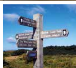
An Acorn National Trail, join the Peddars Way at Holme

Located in a quiet lane backing onto marshes, just moments from the coastal path, beach and nature reserve, Greystones is set over three floors. This luxurious period home has plenty of space, stunning views and room for ten guests and their dogs to enjoy a coastal break.